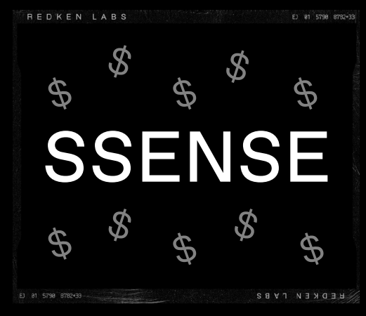
POST ONLINE, SHARE, AND WIN Enter for a chance to win an SSENSE SHOPPING SPREE ($1000 VALUE)