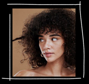
2 HUMIDITY CONTROL

Due to extra time spent in the sun, pools, beaches leading to dry and damaged curly hair.